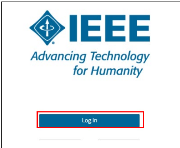
Log In link